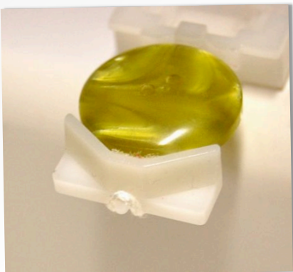
SPUR IN THE BACK

In the front are usually two small slots. Pull the cord up through the slots and tie off. Lower your foot, making sure the cording is not twisted