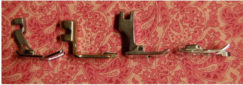
Left to Right: Slant Shank, Low Shank, High Shank, Snap-On